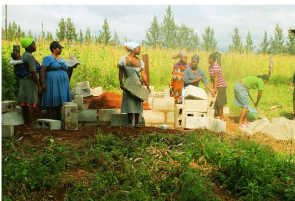
Carers building the toilets at Mahlanya NCP.

All Out Africa is based in Ezulwini and works with six Neighbourhood Care Points (NCPs) along the Mbabane and Manzini corridor. The centres provide basic care and support for Orphans and Vulnerable Children (OVC) in a protective environment, including meals, basic learning and recreation. With the support from the SCT, they were able to put up fencing at Bethany NCP to secure the premises. The community was also helped with the construction of toilets at Mahlanya NCP.