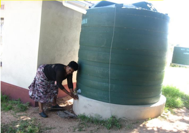
The tank is connected to the gutter to harvest rainwater and has a tap near the base.

Access to safe, clean water for schools is important in ensuring that children stay healthy. Situated near Dvokolwako, a drought-prone area, water scarcity has been a recurrent problem for the school. With the support of the SCT, they were able to purchase four 5000l water tanks which they have put up at the new staff housing, whose roofing was also previously funded by the SCT. With the new water tanks, they are able to harvest rainwater, and when there is a water shortage, use the tanks to store delivered water.