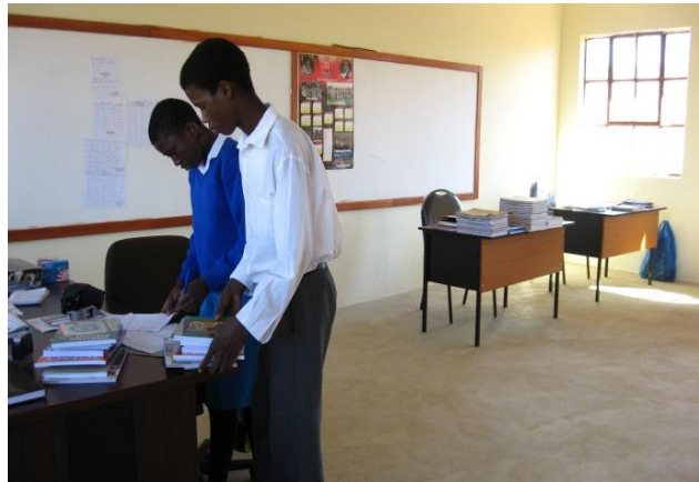
Some of the teachers' desks and chairs (far right) at the corner of the staff-room.