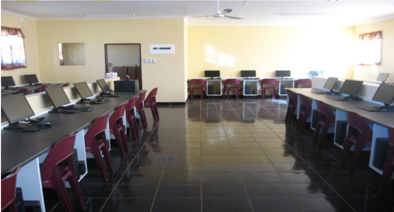
Chairs complete the Hhohho AME Computer classroom.