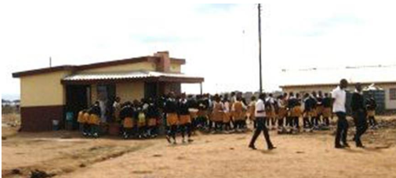
View of the kitchen from the Administration Block entrance.

Ndunayithini is situated approximately 60km from the Lavumisa Border. A few years ago, the school cooks were having to work in a shack and only ever dreamed of having a proper kitchen. With the support from the SCT, it is a reality and they now have a well-equipped kitchen to prepare meals for the students.