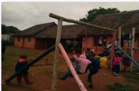
Ezulwini NCP with its new roof.