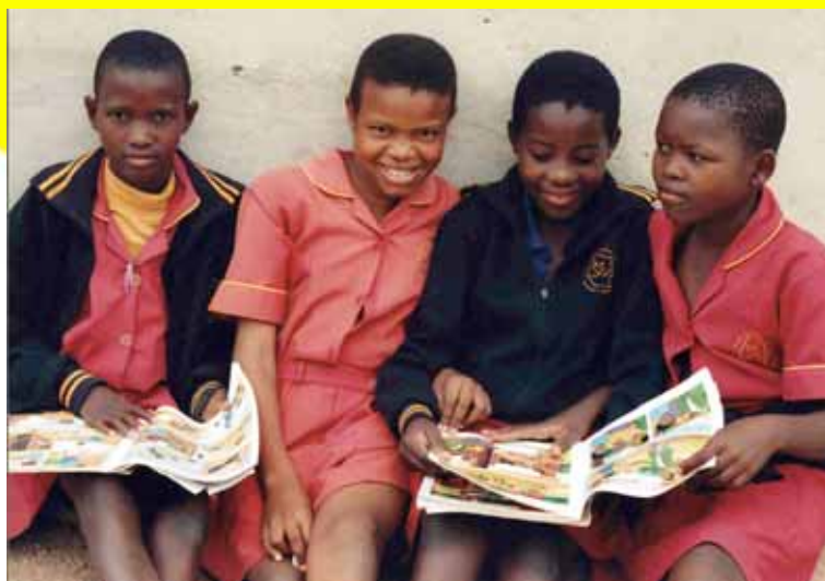
Students at Manzana Primary School