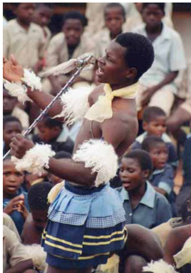
Sibhaca display at Hhohho

The four classrooms financed by the fashion show are now virtually completed. We visited three of them in November. At one, Hhohho Primary, we had a display of some of the best Sibhaca dancing we have ever seen.