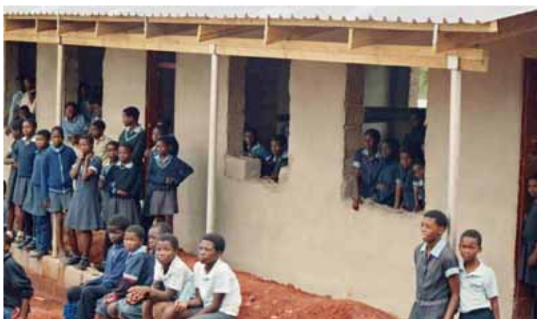
New classroom block at Hhohho Primary