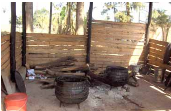
Current school kitchen facilities