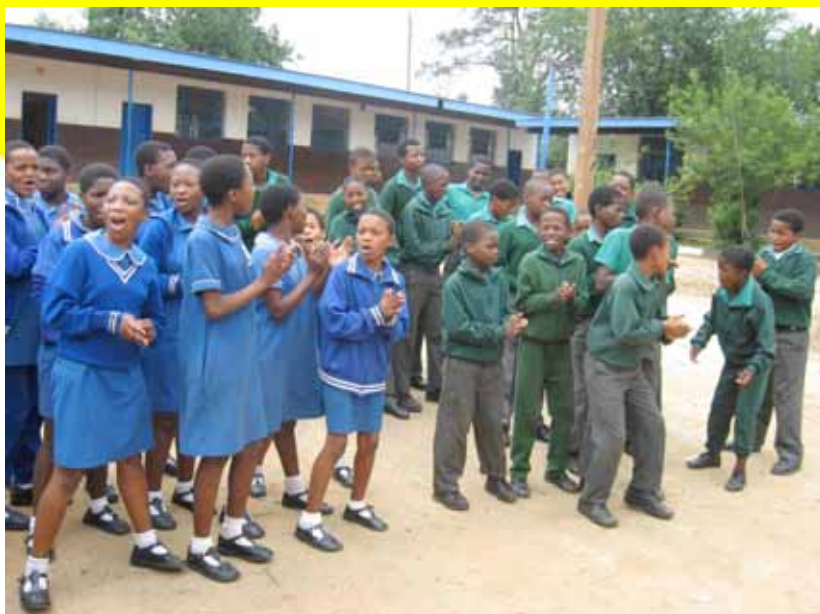
St. Johns Bosco Primary School children singing their thanks.

At St. John's Bosco Primary School, we saw the garden tools and fencing paid for by the SCT. The maize was beginning to grow and the children sang their thanks.